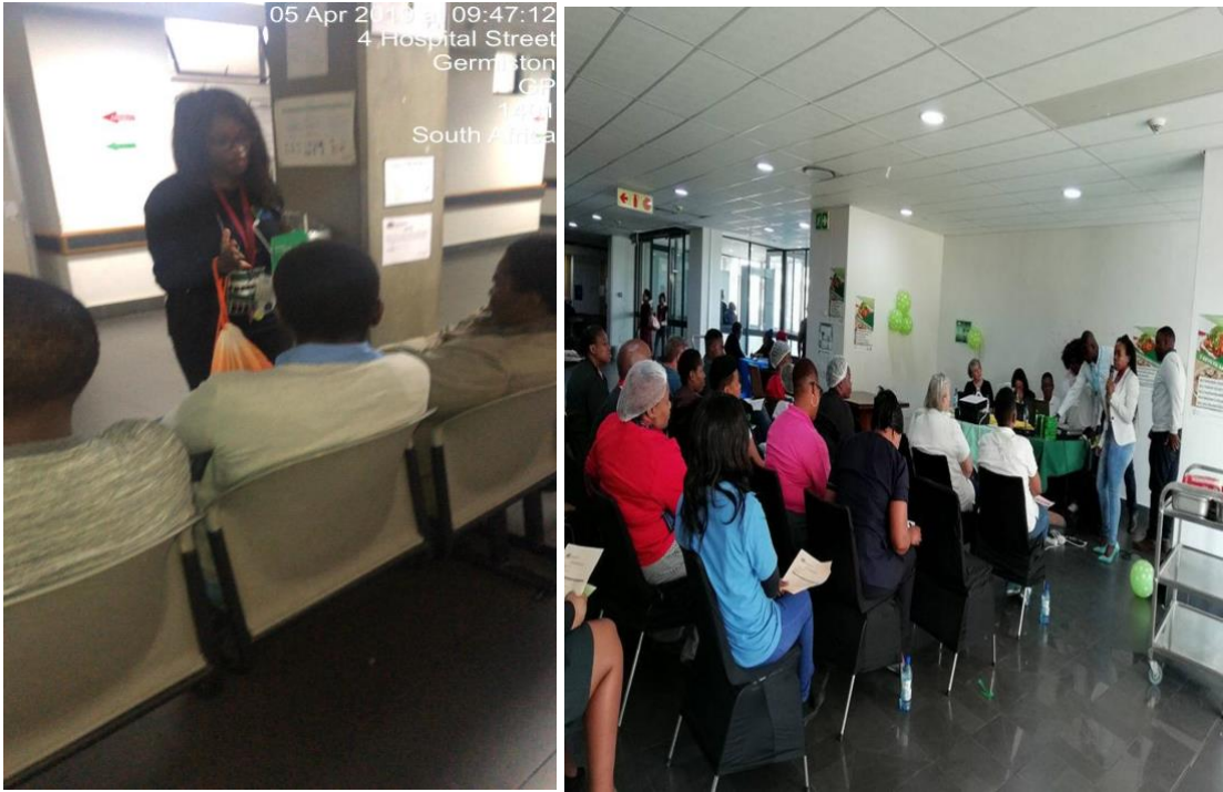
Fig 4: Number of staff trained on insulin management April 2019(150)