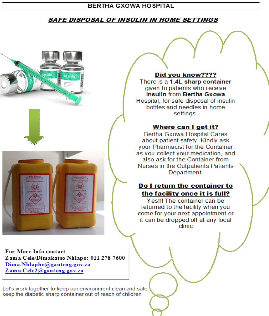
Fig 1: Insulin Management Poster